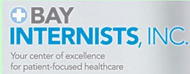
Bay Internists, Inc.