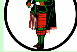
Town of Kilmarnock