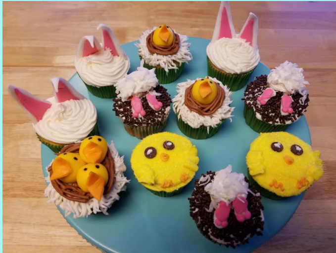
Easter Treats - sweetsbycharlene.com