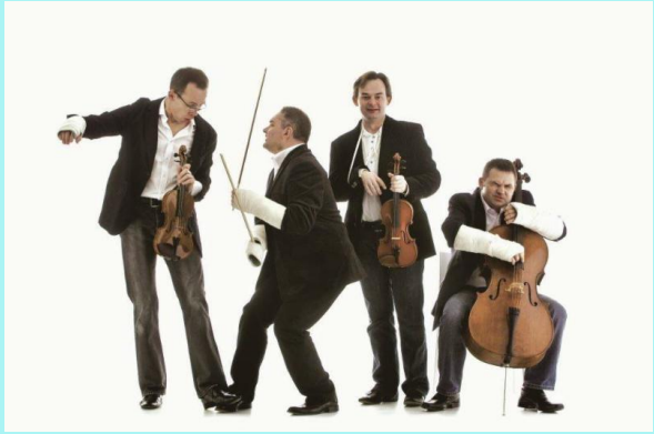
MozART - March 9, 2018