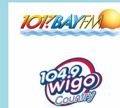
Two Rivers Communications