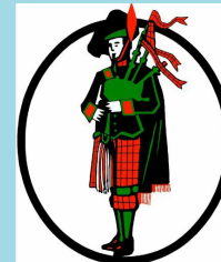
Town of Kilmarnock