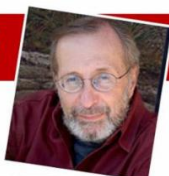
KEYNOTE SPEAKER -

25+ Regional Authors / Children's Storytimes Panel Discussions / FREE WORKSHOPS 1 Hour Sessions Running All Day