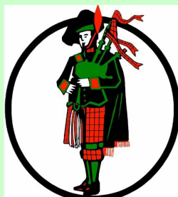
Town of Kilmarnock