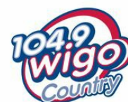
Two Rivers Communication