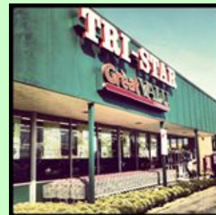
Tri Star Supermarket