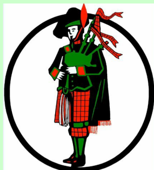
Town of Kilmarnock