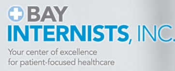
Bay Internists, Inc.